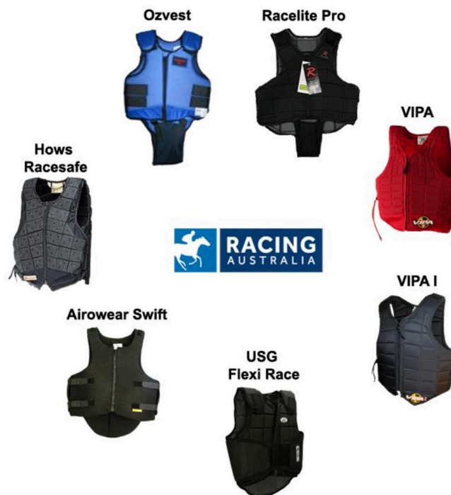
Figure 2 Level 1 jockeys' safety vests approved by ARB (Giusti Gestri, 2019)

To try to reduce the severity of jockeys' injuries, in 1995 the Australian Racing Board commissioned a collaborative study between doctors and engineers to investigate how best to protect jockeys (Gibson, 1996, 1998; McLean, 2004). Based on this study, in 1998 the Australian Racing Board made the use of safety vests compulsory and introduced the Australian standard ARB 1.1998 to which safety vests had to conform. ARB 1.1998 is closely aligned with the European Standard EN 13158, developed in 1986 to address wide variation in jockeys' safety vests, thus establishing minimum standards for coverage of the torso, manufacture, product testing and performance. The reason for developing a separate Australian standard was the perceived climatic differences between Australia and Europe. ARB 1.1998 is certified by Standards Australia. It determines that safety vests are made of perforated foam strips of varying thickness, covered with mesh polyester. Adjustable strips or Velcro® sections at the shoulders and waist keep the vests tight on the jockeys' bodies. Within ARB 1.1998, only two safety vests templates are available, these having to accommodate male and female jockeys of varying body types and sizes.