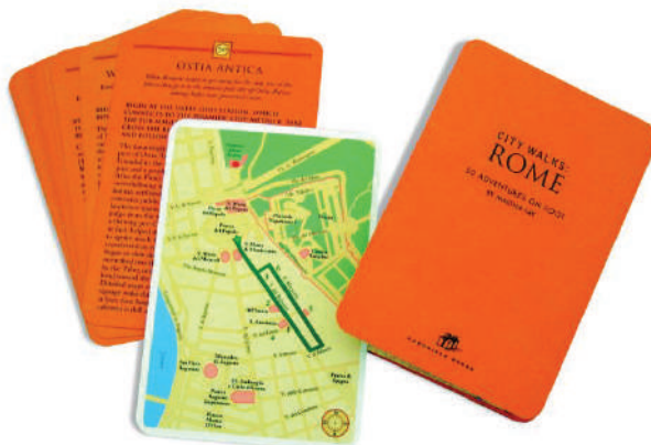
Figure 1 "City Walks: Rome," a precedent discovered while studying guidebooks

Gestalt psychologists have contributed valuable experimentation and research in the area of perception, collecting data and analysing the significance of visual patterns. They are also interested in how humans see and organize visual input and articulate visual output. The way in which elements come together creates the meaning and purpose of the visual statement and carries strong implications for what the viewer receives. Gestalt ideology takes into consideration not only the visual foundations upon which design is built, but it also echoes one of the most valuable messages the natural world has to teach us: that everything is connected.