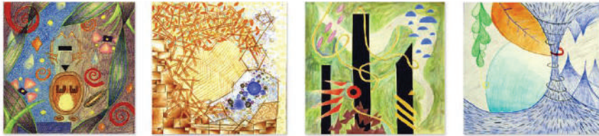
Figure 5 In the second field trial of the same age demographic the final iteration was limited to a final composition in colored pencils.

In the second field trial of the same age demographic (15-17 years old) the final iteration was limited to a final composition in colored pencils. (figure 5) This differed from the first field trial by eliminating the distraction and learning curve of the computer to generate the final piece. This allowed the students to focus and invest in the reiterative design process through hand renditions. Final compositions from this process were stronger: more expressive and compositionally complex. At the end of the exercise, students seemed to recall a more thorough balance of design fundamentals tied with their natural experience. These observations were compared through the students’ post-project write-ups.