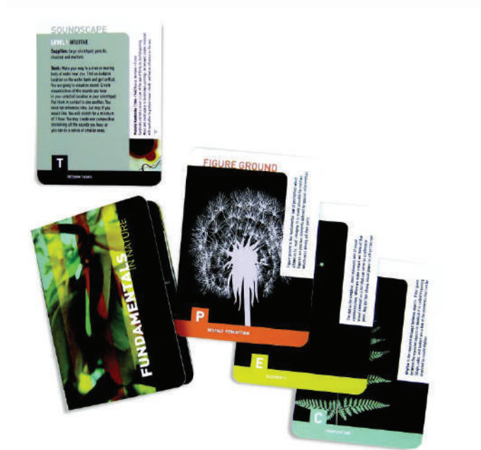
Figure 2 The card system, named “Fundamentals in Nature,” was composed of a booklet to present the card system to instructors and accompany cards comprised of four categories: Task cards, Element cards, Composition cards, and Gestalt Perception cards.