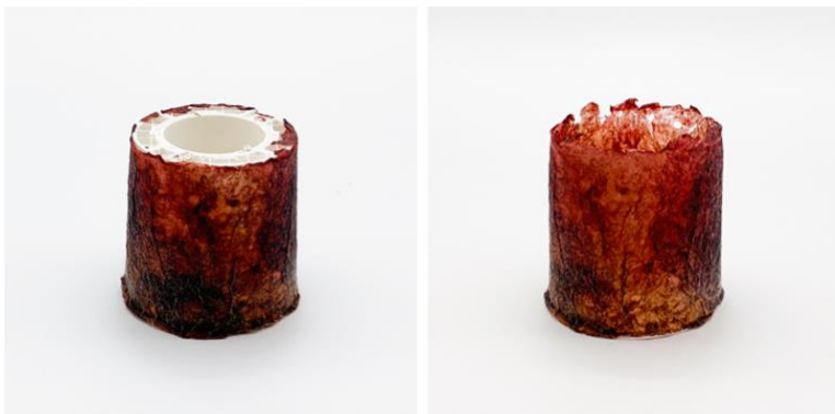
Figure 8. BC "tartare" sample over a 3d printed mold.

There is also the possibility of using the same strategy of the molds created with DFTs to make shapes from BC chopped, which is obtained from cultures that suffer defects on the surface or from scraps produced by other operations with BC. In Figure 8, it is possible to see the application of the same principle of the drawer mold in Figure 7 for the realization of the same shape using BC tartare. In this case the appearance of the final artifact is completely different and at the same time avoids the creation of overlapping parts of BC.