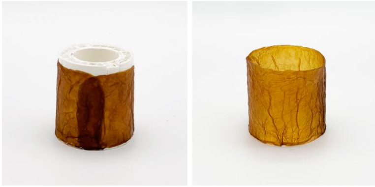
Figure 7. BC layer wrapped over a 3D printed mold.

In Figure 7, you can see how the principle of the drawer mould was applied to create a hollow truncated cone with a layer of BC, without having problems with removal from the mould downstream of the shrinkage of the dried material. Nevertheless, it should be considered how any material overlaps – visible on the left side of Figure 7 – are evident on the final output.