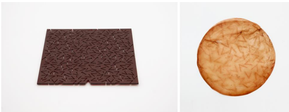
Figure 4. DFTs adopted to realise a negative texture sample, then impressed in the drying BC sample.

In Figure 4 it is shown one of the samples obtained by drying a BC layer by contact and compression with a PMMA sheet. The contact surface has been designed to present perforations (obtained through LC technique). During the drying phase, the texture impressed on the PMMA sheet was transferred onto the drying BC sample.