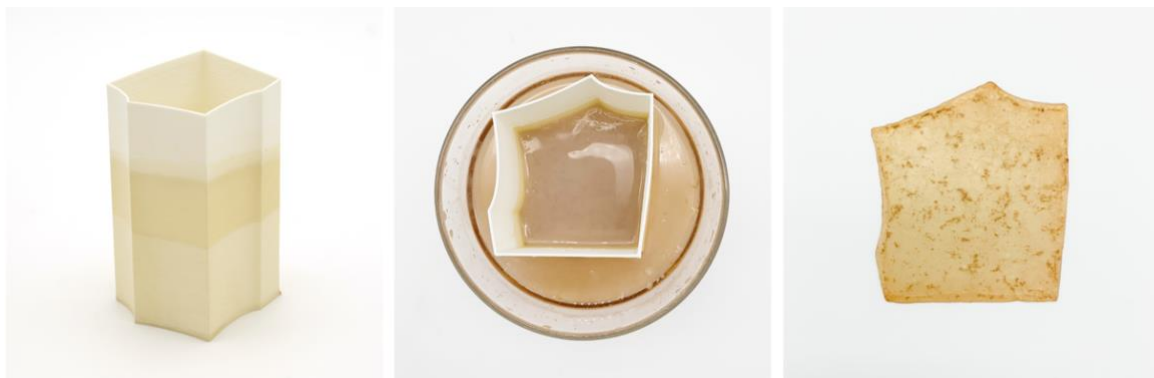
Figure 1. DFTs adopted to generate a specific BC shape while its growing, preventing secondary cut operations on BC samples.

An example of the first type of application of DFTs for BC growth can be seen in Figure 1, in which (from left to right) we can see a hollow shape affecting the BC growth into a cylindrical container. The hollow shape has been realised in PLA with a 3D Fused Deposition Modeling (FDM) printer and then inserted into the container of one of the cultures while growing. This procedure enabled the researchers in generating a final BC sample with an altered shape in respect to that of the initial container, that can be seen on the right side of the picture. This first methodological procedure shows that layers of BC can be produced with specific geometries, which do not necessarily have to undergo further cutting and shaping processes in post-production. Thanks to this strategy, it is possible to reduce the generation of waste of already dried BC after subsequent cuts. The scalability of this technique is particularly useful when products or components in BC need to be produced that do not have a shape like standard containers available in the market or when multiple sizes exist for the same production output (e.g., for products with different fits). During production, there will be no need to modify the growth tank system. Instead, preformed elements can be introduced into larger tanks using a nesting operation, maintaining production efficiency while also making it flexible.