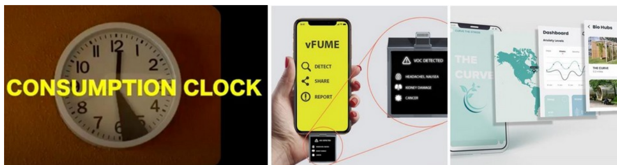
Figure 3. The Consumption Clock (left), the vFume (middle), and The Curve (right).

Creative Problem Solving also challenges students to apply their training to collaborate on a cross-disciplinary project. The projects range from developing elaborate material-functional designs such as Rube Goldberg machines to design interventions for wicked problems. Recent projects from the latter include the Consumption Clock which is an analog proposal for intercepting excessive use of social media, the vFume smartphone plug-in device which allows consumers to detect VOCs in textiles, and The Curve which suggests a design and access system for pop-up bio hubs on college campuses to support the mental health of students (see Figure 3). These projects demonstrate how the DSDs provide the preparation that students need to realize their potential as change agents.