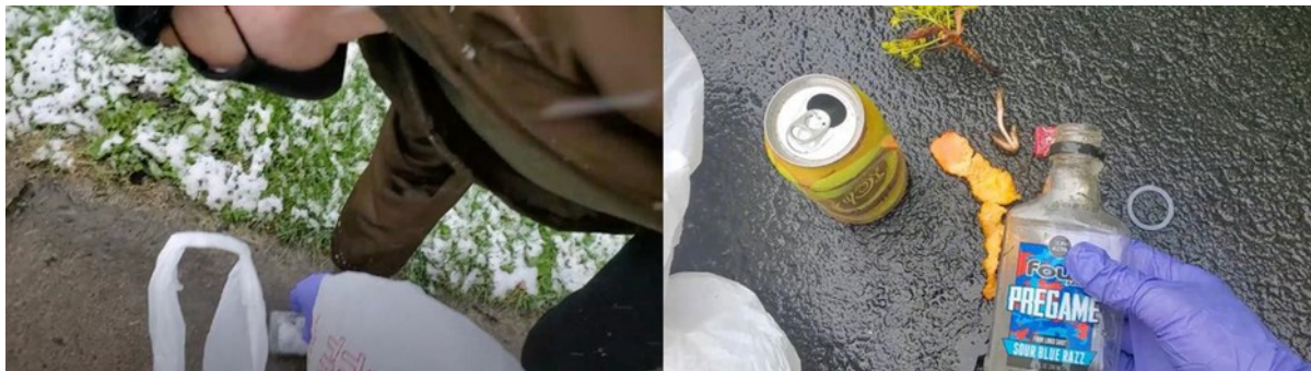
Figure 3. Snapshots from the result of one student's DSD Take in which they reflect on contemporary relevance of a primitive idea: taking from the environment.

This does point to how difficult it is to be a person... you know, if you do not have capital (social or otherwise). You still have to live like a human would have lived back many years ago but without the capability to trade with another person or to receive a gift from another person. You're basically left foraging in your environment which is impossible to do... you can't survive on your own without another person without taking something.