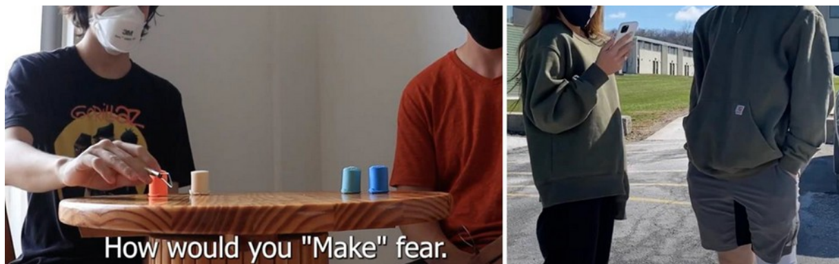
Figure 2. a) Stills from the result of one student's DSD Break in which they challenged their friends an impossible task: to 'make' things that cannot really be made out of clay such as wealth, beauty, and fear (left). b) Stills from a student's exploration interviewing people with questions that relate to the work of a parent (right).

Another example that demonstrates the interpretive potential of the challenges is from DSD Make where a student gathered their friends for an unusual 'making' activity with clay (see Figure 2a). She challenged them to form the clay into difficult concepts to depict such as wealth, beauty, and fear and then talk through the meaning of their creations. The peers who reviewed this DSD reflected on its power to reveal insight about those you think you already know, and its potential as a therapy activity and unique conversation starter.