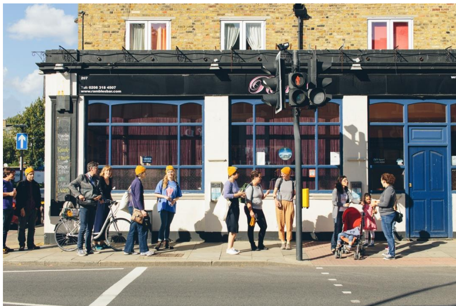
Figure 2 Participants in Antarctica SE3, Catford.

The connection to Antarctica also seemed to promote the format of a walk, or expedition; a format that is an “embodied presence in motion” (Solnit, 2014); one that speaks to tactics of collective protest and resonates with the psychogeographic wandering of Situationist International, or promenade performance experiences. Unlike a turn towards an ‘active spectator engagement’ (e.g. Ranciere, 2007), the participatory format was relational and conversational. It was designed to promote ‘active listening’ (Schrader, 2015, p. 673) or ‘listening with care’ (Puig, 2017, p. 58) through a semi-structured framework for group interaction, where the majority of the conversations were intimate ones between two people.