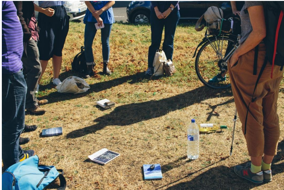
Figure 3 Participants materials of climate change.

The curation of the socio-material setting was carefully considered and existing artefacts and infrastructure were gathered to situate and motivate conversations at a number of points along the route. Although these chosen locations did not connect to the local implications of climate change as obviously as a flood barrier might, say; I wondered whether specific locations of south-east London could be connected to Antarctica through an almost parasitical overlay of materials, concerns and people, a sort of ‘dumb’ augmented reality; by not being in Antarctica; by people walking as an embodiment of an expedition, speculating through a place synonymous with climate change whilst situated in a heat wave?