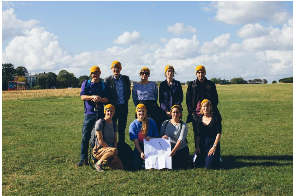
Figure 1 Participants in Antarctica SE3, Blackheath.

with and through these more-than-human things of gases and heat? And what formats enable a quality of self-reflexivity? Last, how to construct the abstract concept of ‘rising CO2 levels’ as an affective experience? If a group of participants wonder about – and wander about – a heatwave, is this a form of embodied speculation?