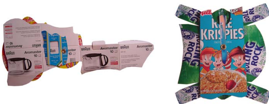
fig. 2 Commercial Rhetoric Art Project assemblages. 13 x 29" top, 17 x 15" bottom. Paperboard, brass grommet. © Steven McCarthy 2005.

Food boxes, cans and product packaging were cut up and forced into new, assembled relationships using only a brass grommet as a fastener. (fig. 2) Some are reminiscent of useful objects: floor coverings, containers, flags, table settings; others fail to function, yet succeed as artistic commentary. Originally, the plastic, metal, glass and paperboard served to functionally contain the food or beverage or pair of shoes, while the role of the label is to distinguish and promote the brand. Conversely, one might wonder if the true role of the container is simply to hold up the brand identity, long after the product is used. The comment attributed to Raymond Loewy, that he wanted his box design for Lucky Strikes cigarettes to be recognizable even when crumpled on the street, seems relevant to the relationship between much packaging and waste.