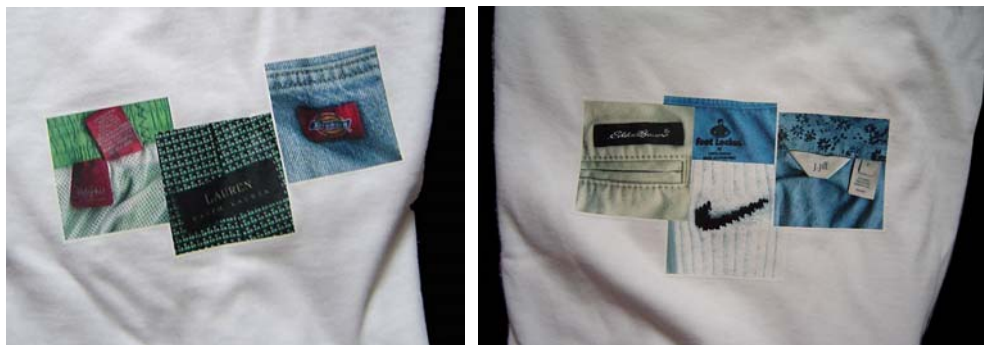
fig. 3 Commercial Rhetoric Art Project apparel (t-shirts). Men's large. Cotton fabric, iron-on transfer print. © Steven McCarthy 2005.

Numerous scans of clothing labels, both from the exterior and interior of garments, were printed onto iron-on material and transferred onto white t-shirts. (fig. 3) Once utilized as a mobile canvas for personal expression, the t-shirt today has minimal commodity value as an article of clothing, but instead serves as a walking brand, emblazoned with logos and slogans.