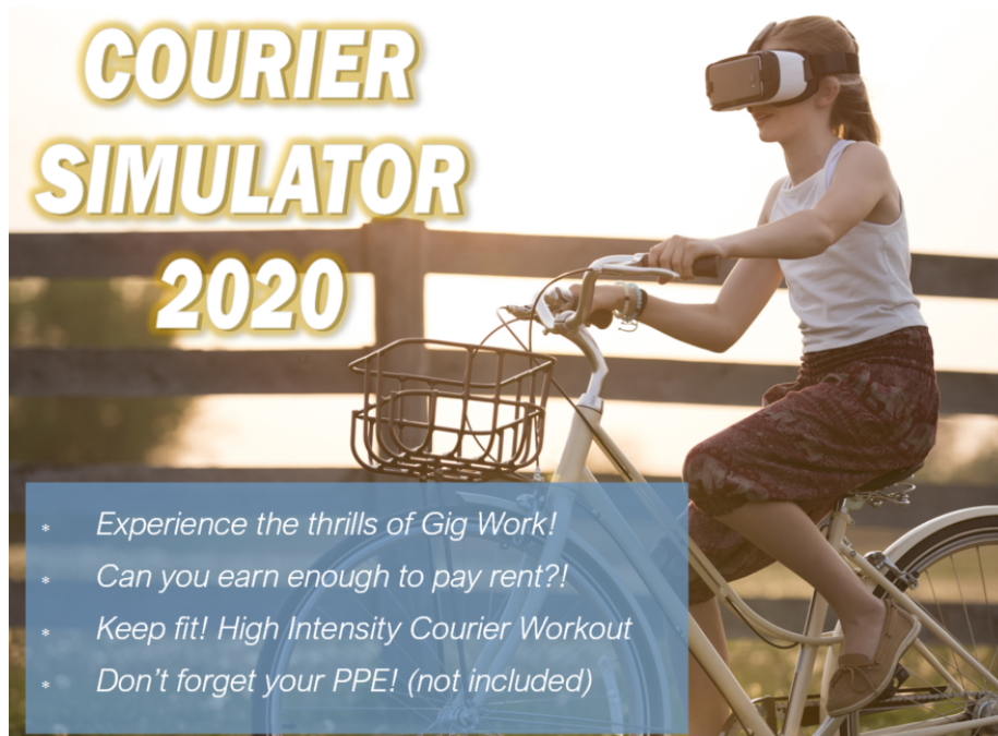
Figure 5. An advertisement for “Courier Simulator 2020” describes the features of the game

All the participants in the workshops used bicycles as their main vehicle. Although riders had many issues with their work and employment, they were also very careful to highlight the joys of this kind of work. Alongside the factors such as being somewhat flexible in their working hours, and in some cases being able to do work while “on holiday” for apps that allowed riders to work in different cities, there was also a strong feeling that riding bicycles was itself enormously rewarding and joyful. The fun of riding a bike, getting exercise and being outdoors for their work was a common positive point.