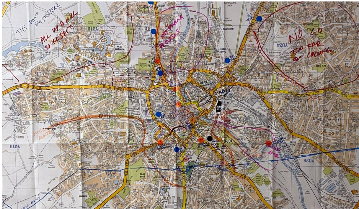
Figure 6 A photo of the A-Z Map of York, annotated in pen and stickers by riders.

This really crystallised during a map annotation activity which became central to both workshops. A local street map for each city was brought to each workshop to support activities, but quickly became extremely important as a tool for expressing their experiences of their work. This was unexpected, but upon reflection, natural, since the city, and the map of the city as seen on the delivery apps, is a lens through which riders experience their work.