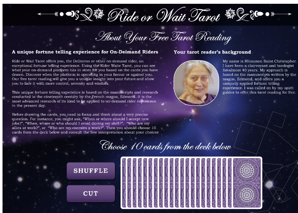
Figure 3. The Ride or Wait tarot website shows a deck of cards and invites couriers to consult with a clairvoyant before starting their shift

A consistent theme running through both workshops was the mystery of how work is allocated through the various apps. From the courier perspective, they get precious little information on how jobs are distributed by the platforms. Some reported frustration at seeing other riders being allocated jobs even though they had waited longer, and others speculated on the range of factors that might be considered by the platform. Riders developed various folk theories and superstitions based on hearsay and derived from personal experience. For example, refusing a longer job because then the algorithm might then choose to send them shorter, more profitable ones, or by waiting further away from the big restaurants in the belief the platform prefers riders to not hang around outside popular places. Or even the exact opposite, that they are better to be more central or nearer the restaurant (Cant, 2019).