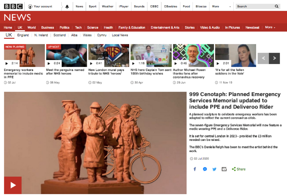
Figure 2. A modified news article describing a new statue for key workers, that has been modified to include a gig working cyclist.

The workshops for this project happened in the early stages of the Covid-19 pandemic, just before the first UK lockdown. At that time, there was growing national recognition of the importance of “key workers”, with special appreciation of medical professionals handling the growing crisis (e.g., “Clap for our Carers” (Addley, 2020)). Although couriers were generally understood as key workers, our participants expressed some frustration that they perceived their contribution was not recognised by their local communities. There was a sense they felt “hidden” and disrespected, and often in conflict with the city they serve. Customers hold them responsible for issues out of their control and are quick to complain about the service. There were frequent stories of conflict on the streets, with other road users, members of the public, restaurant staff and the platforms themselves, leading to a general feeling of alienation from their community and lack of respect for their work.