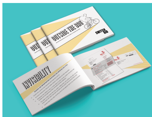
Figure 1. The design fictions are collected into a booklet that contains further elaboration on the issues faced by couriers in their work

In this section we highlight four of the design fiction “provocations” generated in collaboration with couriers, to illustrate both the concepts and the underlying insights to which each design reflects. The full collection of designs is available on the website (Switch-Gig, 2020).